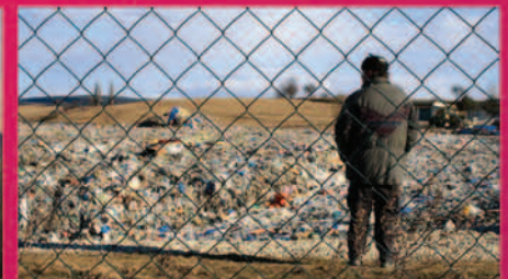
Competition entries from previous years

"If sustainable development is to be a reality, youth will be at the centre of the necessary transition. Today's consumers, tomorrow's decision makers – youth will define our success. The YRE winners represent some of these potential change makers."